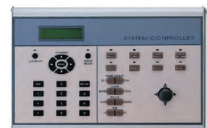
JCK-238 Keyboard Controller