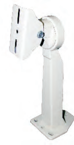
■ JC-105 / JC-105A