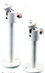
■ JC-106 JC-106L ■ JC-106S