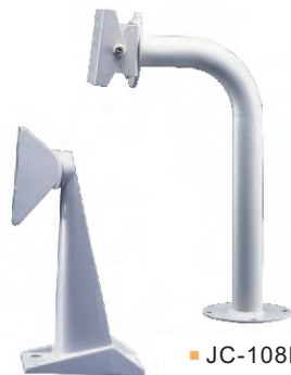
■ JC-108 ■ JC-108L