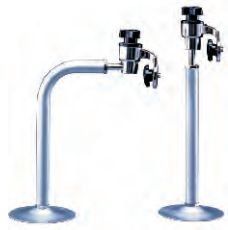
■ JC-102L ■ JC-102